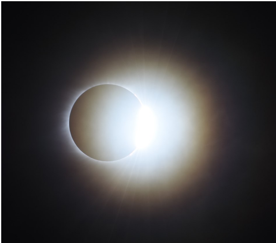
Diamond Ring

I went sightseeing the next day. The train left at midnight. It was delayed and the passengers talked to each other like friends. I met someone who knew a friend of mine and we went home together. And I joined the National Capital Astronomers - hoping for more opportunities to view our great Universe.